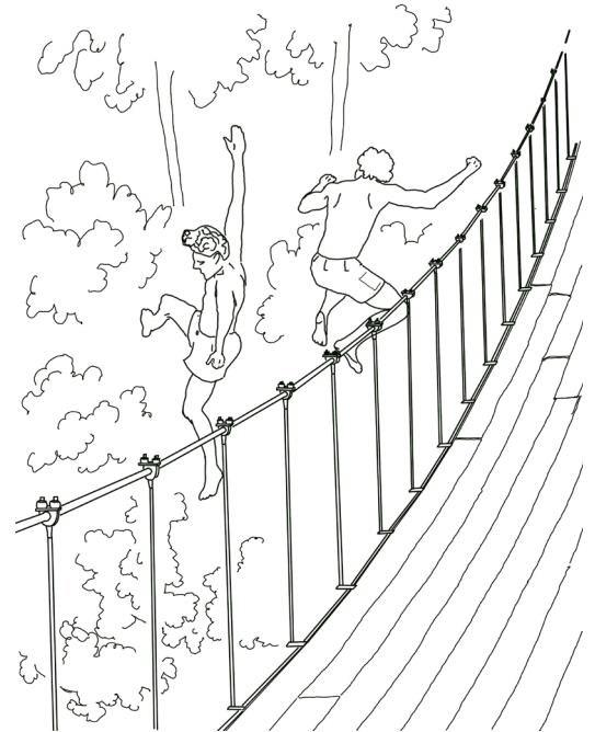
The bridge at Camp McDowell stretches across Clear Creek; you should never jump off the bridge without adult supervision.

30 They shall come and make known to a people yet unborn * the saving deeds that he has done.